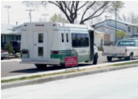
La Junta City Bus

Southeast Colorado Enterprise Development (SECED) has undertaken a study to prepare the Regional Transit Plan. The partners included in the Plan are Baca, Bent, Crowley, Kiowa, Otero, and Prowers Counties, and the local governments.