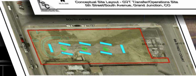
Figure VII-2 Conceptual Site Layout - GVT Transfer/Operations Site 5th Street/South Avenue, Grand Junction, CO

Mesa County Regional Transportation Planning Office